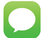
iMessage Ideal for person-to-person and group messages