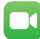
FaceTime (for voice calls only)